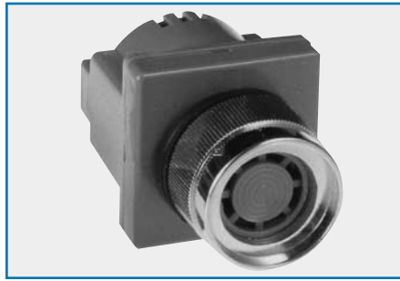
Mounting Cutout Model K402: 1.18" Dia. Model K4025: 1.00" Dia.