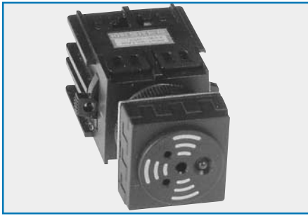
Mounting Cutout 1.00" Dia.