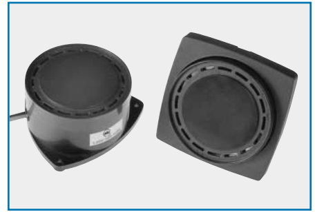
Mounting Cutout 2.70" Dia.